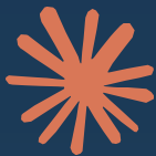
Claude via Desktop

This document is meant to be uploaded to the AI of your choice for technical support. Drop the PDF into Claude, ChatGPT, Gemini, or Copilot. Tell it which 1102tools MCP you want and which client you use. The AI will walk you through every step. About 10 minutes from API key to first query.